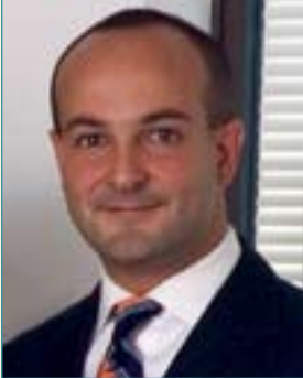
Joseph R. Betancourt, M.D. Director of the Disparities Solution Center, Massachusetts General Hospital

Diabetes can damage your blood vessels, including the arteries that supply blood to your brain and heart. This damage makes it easier for fatty deposits (plaques) to form in the arteries that can choke off blood supply and drive up your blood pressure and cause a heart attack. If you have diabetes, you're two to four times as likely to have a heart attack or stroke as someone without diabetes; you're more likely to die of a heart attack; and your risk of sudden death from a heart attack is the same as that of someone who has already had a heart attack.