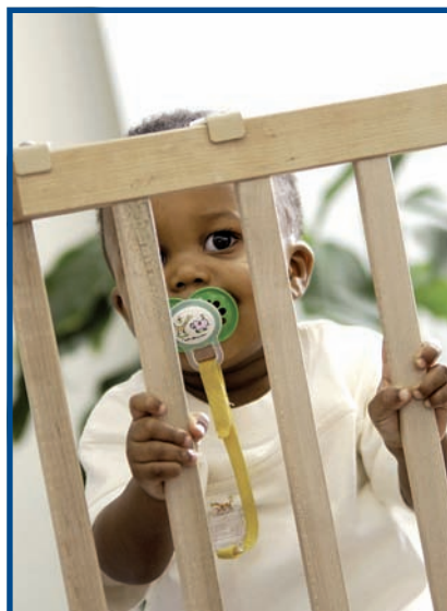
Safety gates can help prevent falls and keep children out of potentially dangerous rooms.

Window guards and safety netting provide security for children who may explore the windows in the house. Also, install window cord safety devices to prevent accidental strangulation. Use corner and edge bumpers to soften sharp furniture edges. It is also important to secure furniture such as bookshelves, entertainment centers and bureaus to the wall so that they