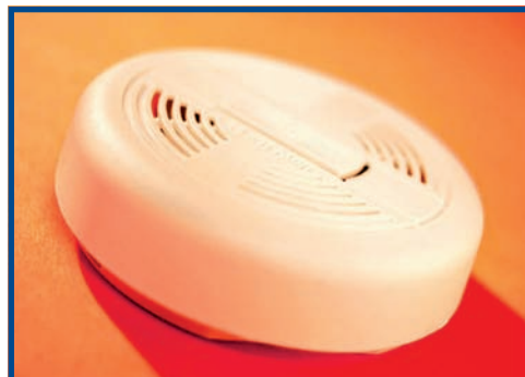
Install smoke detectors in every bedroom and hallway.

don't topple unexpectedly onto small children.