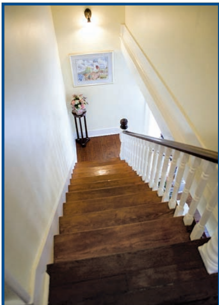
Keep stairways clear, install hand rails and use adequate lighting to prevent falls.

Inadequate lighting throughout the house is another major cause of falls in the home. Provide each room with sufficient illumination to avoid tripping over hidden obstacles. Always keep a nightlight on at night, or better yet, have a lamp near your bed so you can turn on the light before getting up.